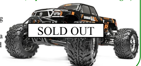
Savage XL Flux £564.99 (requires batteries and charger)

Note the price excludes the batteries and charger. Two 11.1V lipos are needed costing £50 each. Either two £32 single chargers or a £70 dual charger would be the usual charger setup.