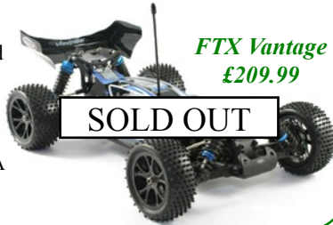
FTX Vantage £209.99

This car comes with a 7.4V 3,250 mah lipo battery and a 3 hour (approx) charger. A faster (approx 1 hour) charger is available for £23.