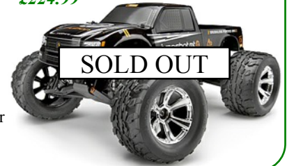
Jumpshot Fuzion £224.99

The Jumpshot Fuzion is a 1/10th scale 2WD monster truck capable of travelling at speed over grass and dirt. An unusual feature is the combined brushless motor and speed controller and water resistant electrics. Ballraces, independent suspension with long oil filled dampers and a slipper clutch to protect the gears are also standard.