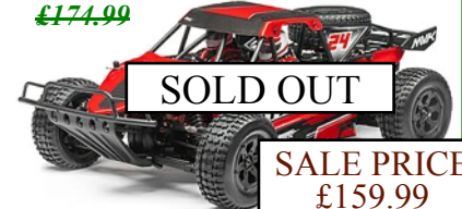
Strada Evo S DT £174.99

The Strada Evo S range is upgraded from the standard Strada Evo with a more powerful and efficient brushless motor and a higher capacity 3000 mah ni-mh battery.