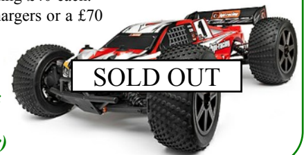
Trophy Truggy Flux £449.99 (requires batteries and charger)

The Trophy Truggy Flux has the same very powerful brushless motor as the Trophy but with bigger wheels and more suspension travel. This gives it better ground clearance for rough surfaces. Metal oil filled shocks, all steel gears and a metal chassis come as standard. This car can top 45mph with superb grip and stability. Note the price excludes the batteries and charger. Two 7.4V lipo batteries are needed costing £40 each. Either two £23 single chargers or a £70 dual charger would be the usual charger setup.