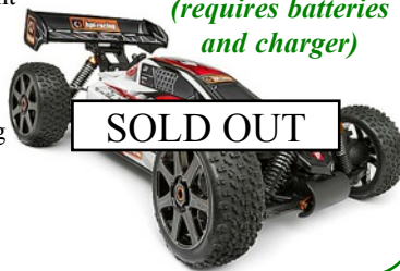
Trophy Buggy Flux £399.99 (requires batteries and charger)

Note the price excludes the batteries and charger. Two 7.4V lipos are needed costing £40 each. Either two £23 single chargers or a £70 dual charger would be the usual charger setup.