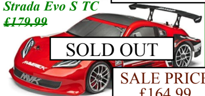
Strada Evo S TC £179.99

The TC (touring) and DC (drift) variants are saloon cars suitable for tarmac running only. The DT has the same electrics but with more ground clearance for off-road running.