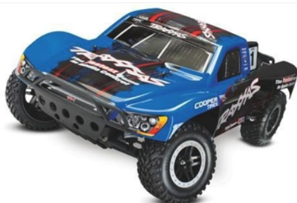
Traxxas Slash XL-5 £284.99

The Traxxas TRX-4 Land Rover Defender has a great looking fully scale bodyshell complete with roof rack, grille and snorkel. It also has many unusual features that let it traverse the roughest terrain. These include portal axles for extra ground clearance and lockable differentials and high/low range gear selection that can be controlled from the transmitter.