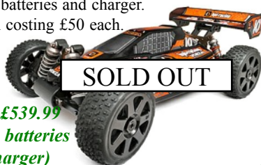
Vorza £539.99 (requires batteries and charger)

Note the price excludes the batteries and charger. Two 11.1V lipos are needed costing £50 each. Either two £32 single chargers or a £70 dual charger would be the usual charger setup.