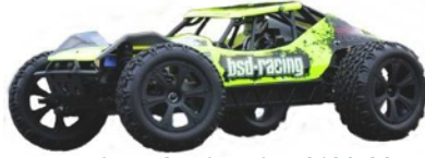
Flux Onslaught £199.99 (requires charger)