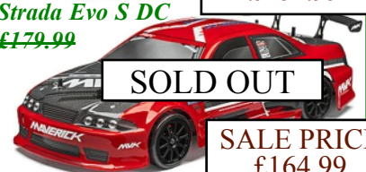
Strada Evo S DC £179.99

A fast charger costing around £13-£25 would be recommended as an upgrade to the standard slow charger.